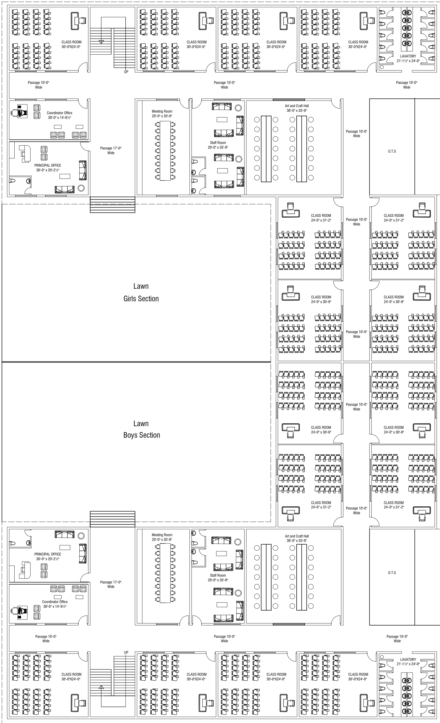
GROUND FLOOR PLAN C.AREA = 32711 SFT

Notes: ALL DRAWINGS ARE THE PROPERTY OF "UAP ARCHITECTS" AND MAY NOT BE REPRODUCED OR ALTERED WITHOUT WRITTEN PERMISSION FROM "UAP ARCHITECTS". NO DRAWINGS WILL BE USED AS CONSTRUCTION WITHOUT OFFICIAL SEAL AND SIGN BY "PRINCIPAL ARCHITECT UAP".